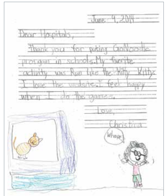
A letter of gratitude from a satisfied student who used the GoNoodle (HealthTeacher) program.

This online health education curriculum gives K-12 teachers tools to incorporate crucial health information into the day's learning. HealthTeacher educates students about the importance of exercise and good nutrition and encourages them to avoid risky behaviors such as alcohol consumption and tobacco use. This year HealthTeacher was expanded to include GoNoodle, a suite of web-based games designed to encourage physical activity and relaxation breaks in elementary classrooms. Research has shown that these short bursts of physical activity — “brain breaks” — have a positive impact on academic achievement, overall health, cognitive skills, and behavior. The brain breaks feature cartoon characters and Olympic athletes who guide the kids through breathing, stretching, and energizing exercises. Teachers have a choice of brain breaks, depending on whether the classroom needs to be calmed down or invigorated.